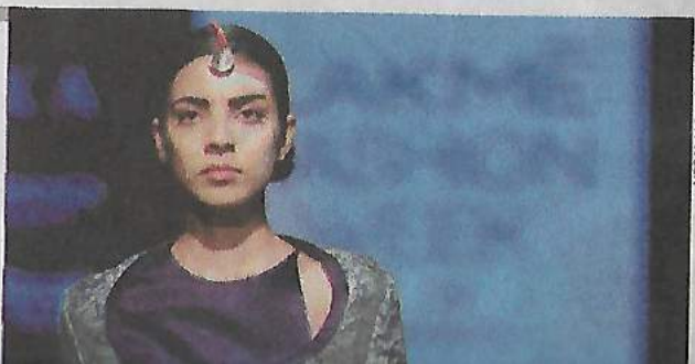
LAMÉ FASHION WEEK

The classic A-line cut, be it a lehnga set or a tea-dress, bears an unmistakable resemblance to an anar or fountain cracker. Rajesh